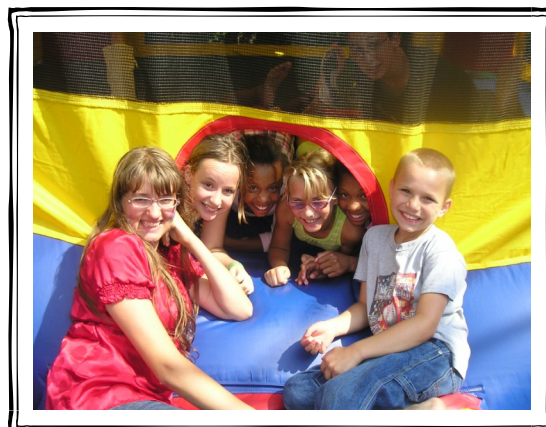
Cameron Kids having fun at the Summer Family Carnival