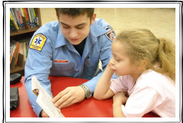
Local firefighter participating in our Dr Seuss Birthday Reading Day—March 2009