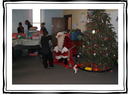
Santa talking to a child at the annual Neighborhood Santa Party

Cameron offers several holiday programs and saw record numbers of attendees in 2009. We are grateful for the support we receive from the community to help us with these programs.