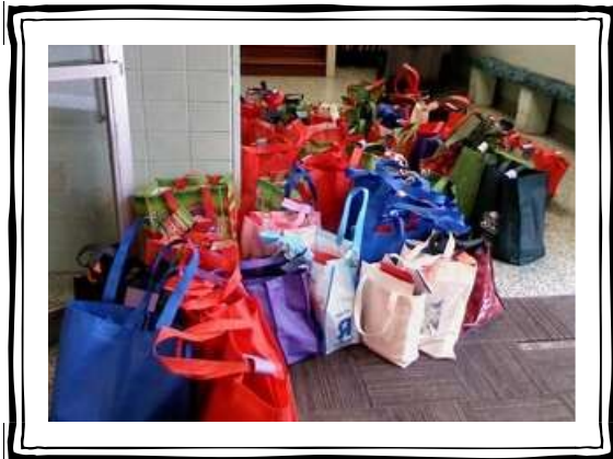
Christmas bags of treats for Cameron's Quad A afterschool program